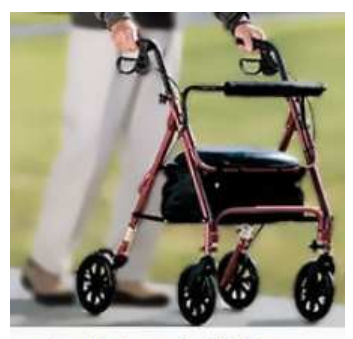
Rollators & Walkers